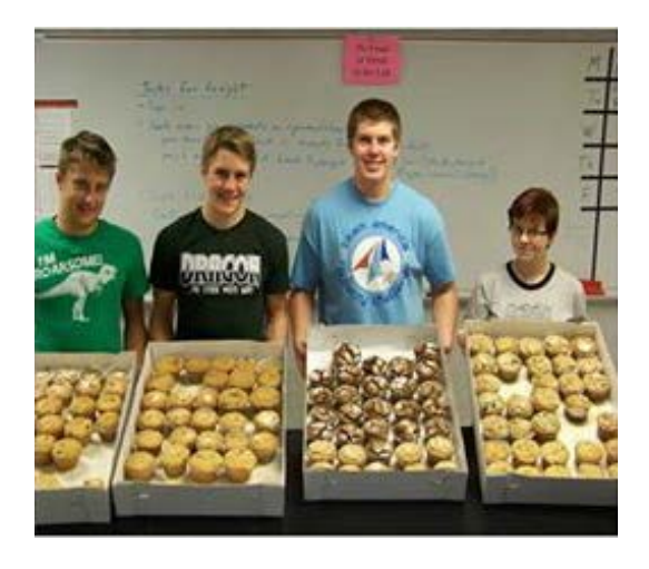
Students at Medford Area Senior High School baked and sold more than 9,000 jumbo-sized muffins to fund their team using more than ¾ ton of muffin mix, 200+ pounds of chocolate chips and 40+ pounds of blueberries!